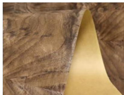
Mappa / Poplar Burl